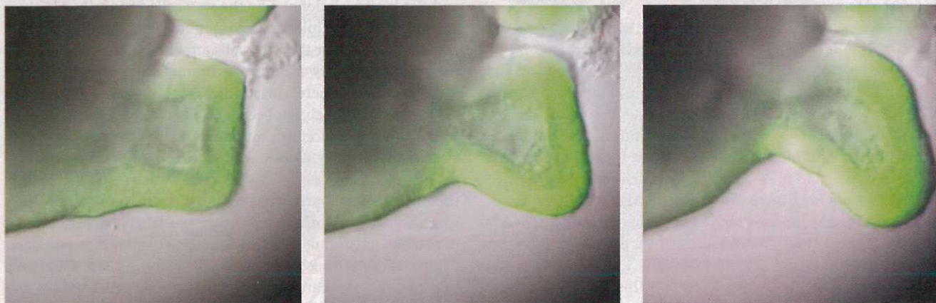
SELF-CONTROL: Floating in an uncrowded lab dish, human embryonic stem cells self-assemble into a nascent eye during several days ( left to right ).